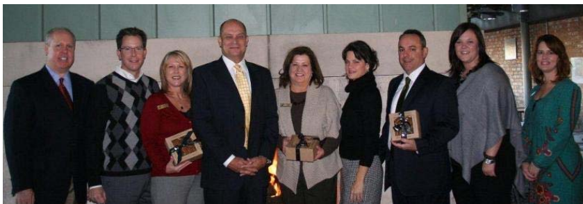
Grant Patrol Donor Park Place Lexus provided cars and drivers for the day.

The Foundation is awarding a record $100,000 in grants this year. Funding for the grants program comes from the following generous sponsors: Huawei, Park Place Lexus, Plano ISD Council of PTAs, the Andrea-Mennen Foundation, The Flextronics Foundation, Alliance Data, InTouch Credit Union and the Murphy Chamber of Commerce. Since the Foundation's inception more than $695,000 has been awarded to Plano ISD teachers through the Grants to Educators program.