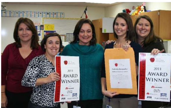
Daffron Elementary Teachers Celebrate Their Award

Plano ISD Education Foundation board members, program sponsors, district staff, and parent leaders will personally deliver nearly $100,000 in monetary awards on Thursday, November 3, to fund 81 innovative instructional programs. The Park Place Lexus Grant Patrol will travel throughout the 100 square mile district in nine cars courtesy of Park Place Lexus.