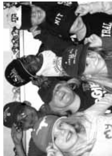
Teaching Tomorrow's Graduates Today