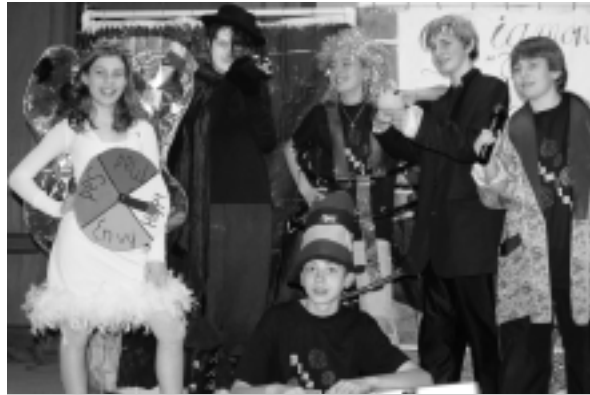
State Bound – Frankford Middle School's DI team is among several teams that will represent PISD at state.

DI Teams Qualify for State – Several Destination ImagiNation teams from PISD qualified at regionals to compete at the upcoming state tournament. Capturing first place awards were students from Barksdale, Carlisle, Hughston, Jackson and Mendenhall elementary schools; Haggard and Frankford middle schools; Shepton and Jasper high schools; Plano Senior High School; and a combined team from Williams and Vines high schools and Murphy Middle School.