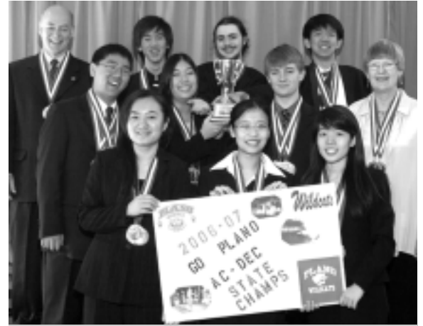
State Champs – PSHS's Academic Decathlon Team will compete for the national title this April in Hawaii. Students won $20,000 in scholarships at the state event.

Plano Students Sweep Regional Science Fair – Students from Plano schools in grades K-6 swept the grand prize awards at the North Dallas Regional Science Fair held on February 22 at Plano Centre.