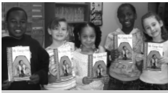
Happy Campers ~ Davis Elementary School students show off their new books, "My Camp Out," donated by the Plano Retired Teachers Association.

The Plano Retired Teachers Association, in conjunction with the state, shares books with children in Title I reading programs and other children with economical needs. Last school year, the Plano group gave 5,200 books to children in Title 1 programs.