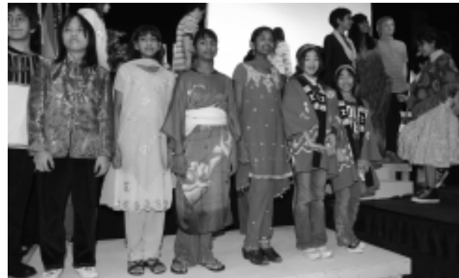
Students participating in the opening Parade of Nations hailed from district middle schools, Spanish clubs, AVID classes and special education programs.